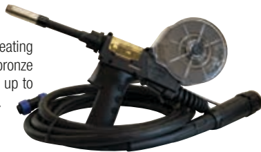
SUREGRIP SP15 150 AMP

$785.00 Including GST $682.61 excluding GST XASP15-24-P1-60ER